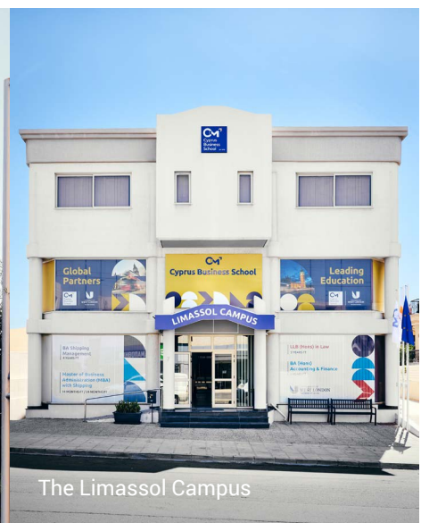
The Limassol Campus