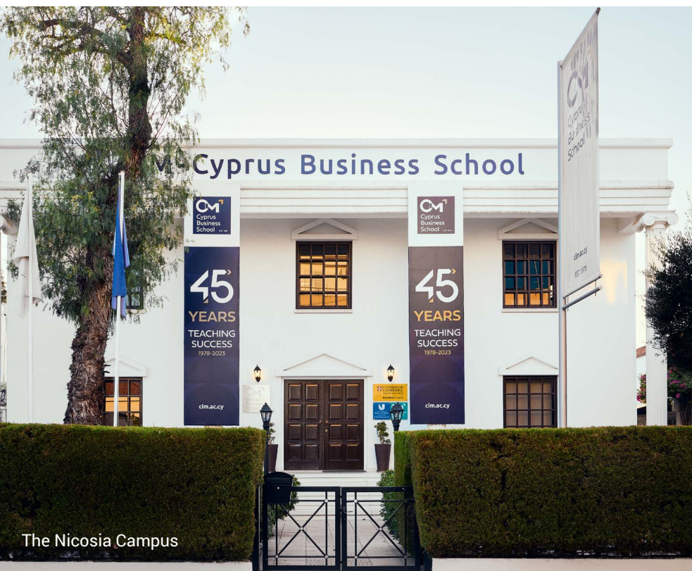
The Nicosia Campus

Over the years, CIM-Cyprus Business School has provided the opportunity to more than 10,000 students to acquire acclaimed qualifications and fulfil their aspirations. A lot of our students are individuals who had missed out, for one reason or another, on the opportunity to study after graduating from secondary school, yet who always had the desire to pursue learning, gain further knowledge and qualifications, and advance their careers. Though CIM serves students of all ages and all walks of life, we still offer evening classes exclusively – in order to cater for the needs of working individuals. We still put emphasis on combining theory and practice and remain committed to offering the best and most accessible education at the most affordable fees.